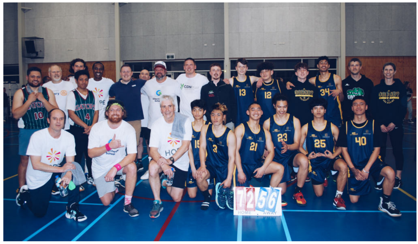
Hornby invitational team with Hornby High's Senior Boys A basketball team